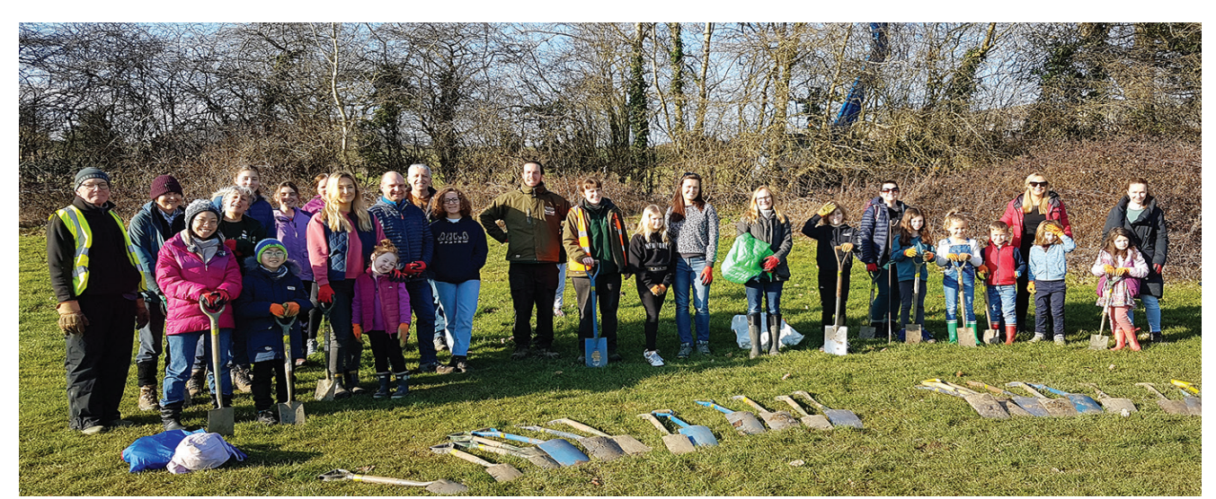
The Totley Hall Park tree-planting team.....