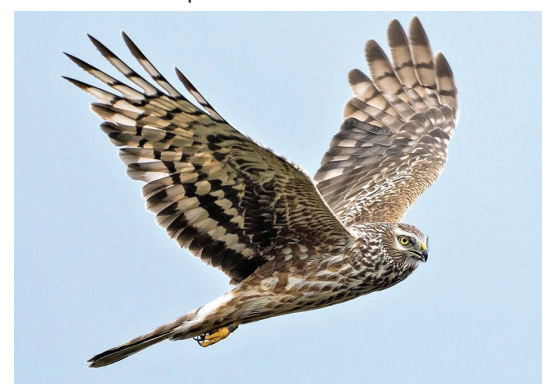
Hen harrier in flight

I will continue to champion these issues in Parliament.