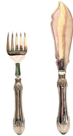
1920s art deco Shefield Silver Plate Fish serving fork and knife

Matters were really stirring in the spoon manufacturing industry. Sheffield's silversmiths were determined to beat undercutting by German manufacturers and were offering the cheapest spoons ever made. Sheffield's electro-plated teaspoons were being sold at one guinea a gross making them a penny and three farthings each. A Sheffield cutlery company announced it was negotiating a contract to make three million spoons for a well-known British retailer. Canteens of Sheffield cutlery were being sold for two guineas (£2.10p). Good quality Sheffield scissors were selling for less than the equivalent of 10p. And what about the chore of keeping the family silver clean? Sheffield was already fam-