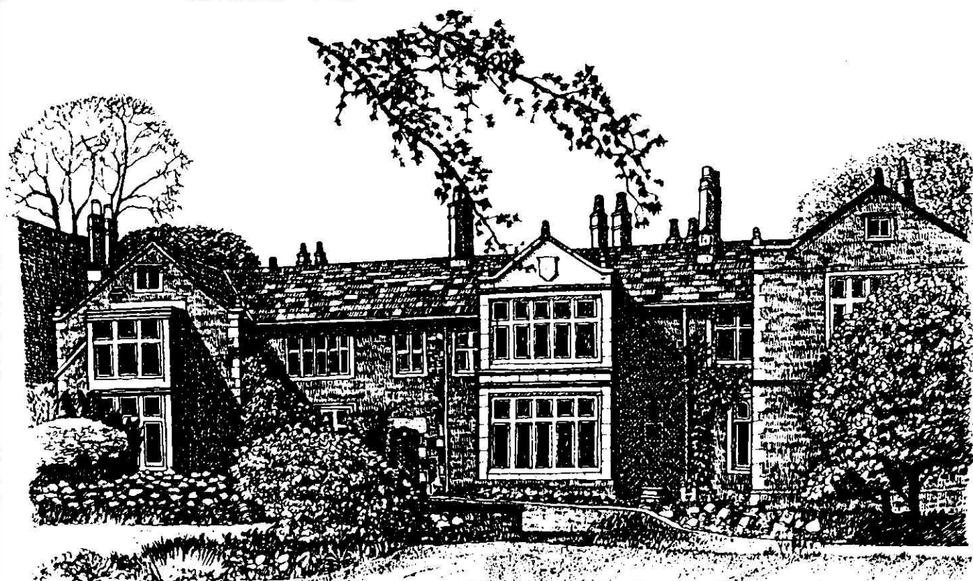
TOTLEY HALL 1980 BRIAN EDWARDS