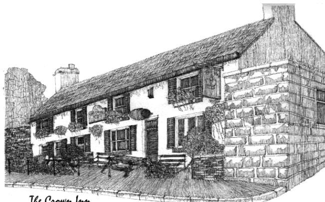
The Crown Inn