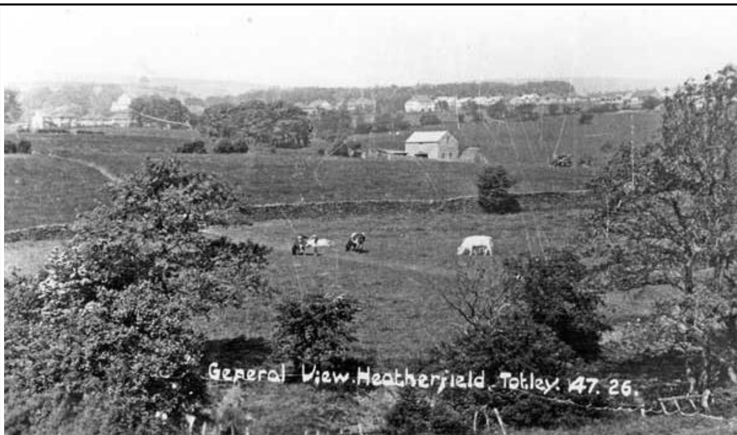
General View Heatherfield Totley. 147. 26.