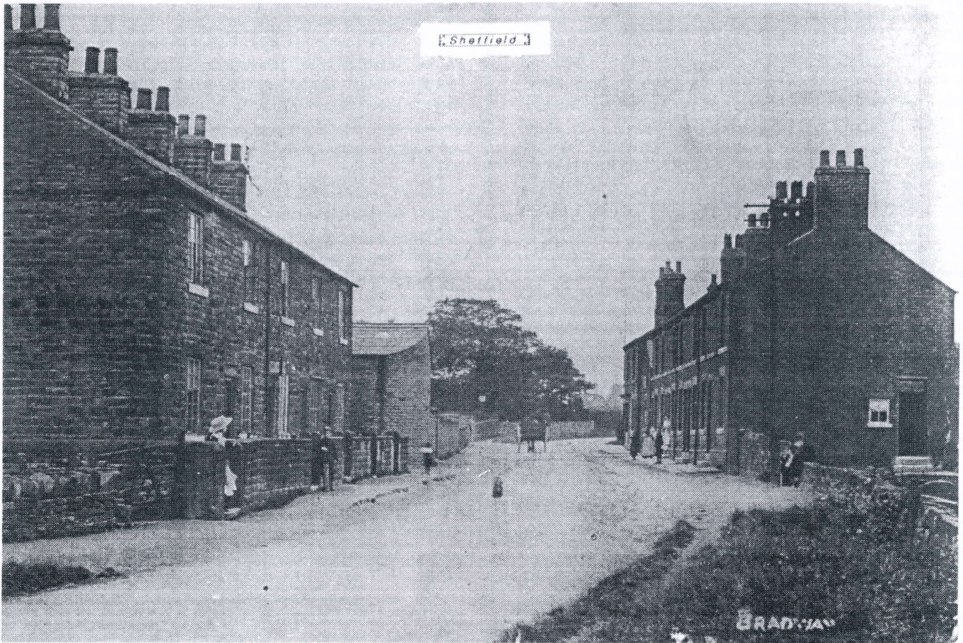
Bradway Road in the days of the horse and cart. This picture is taken from around the Bradway Hotel looking towards the top of Twentwell Lane. The cottages on the left hand side are no longer there.